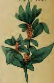
Pelitory of the Wall